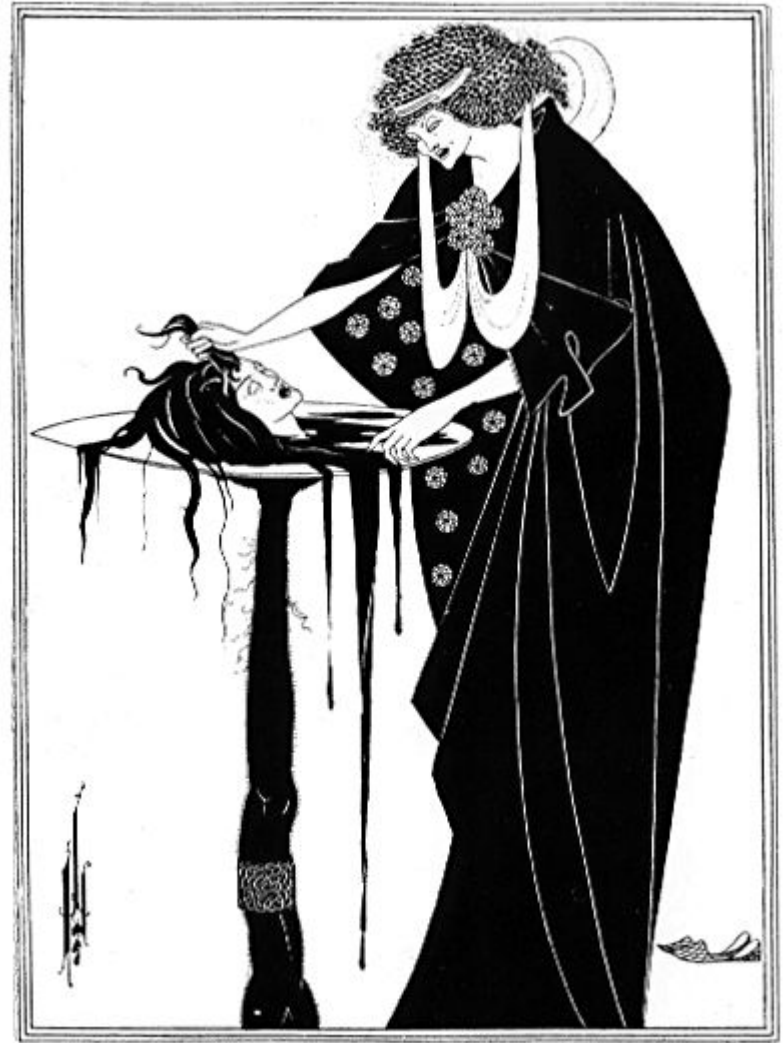
The Dancer's Reward Oscar Wilde , "Salome" .ed 1907