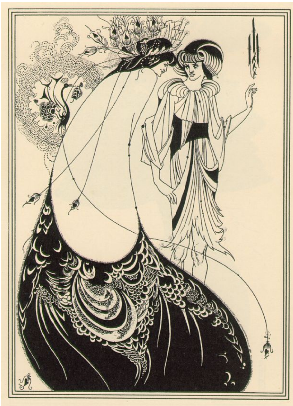
Aubrey Beardsley 1872-1898 The Peacock Skirt 1893