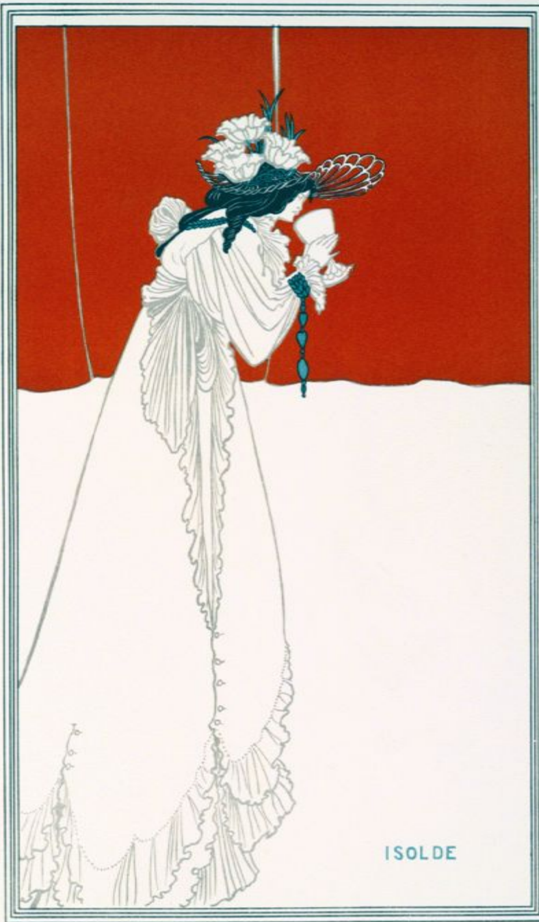
Aubrey Beardsley (1872-1898) "Isolde", by Aubrey Beardsley Chromolithograph