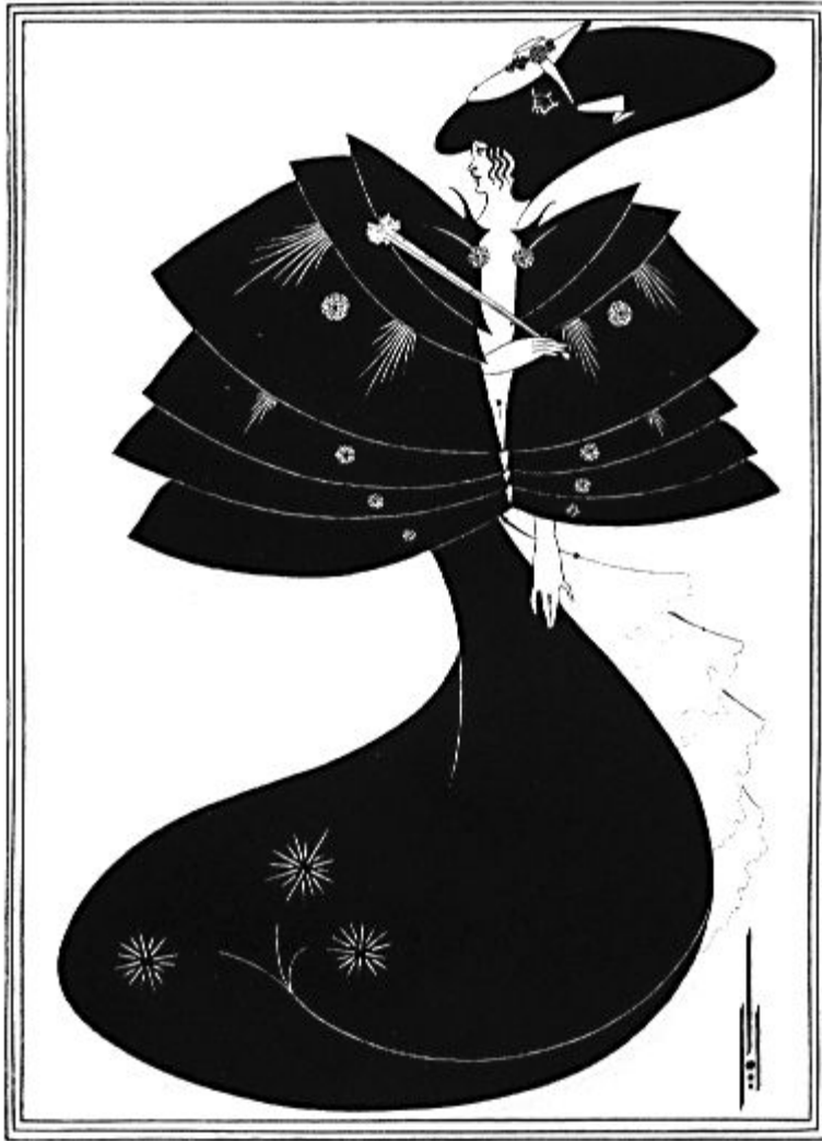
The Black Cape Oscar Wilde , "Salome" .ed 1907