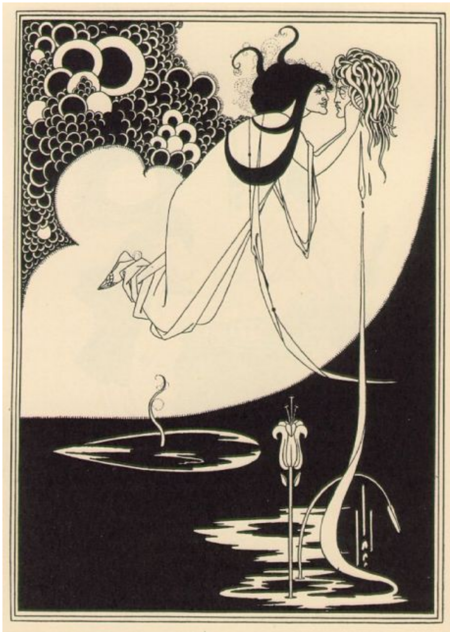
Aubrey Beardsley 1872-1898 The Climax 1893 From Salome by Oscar Wilde