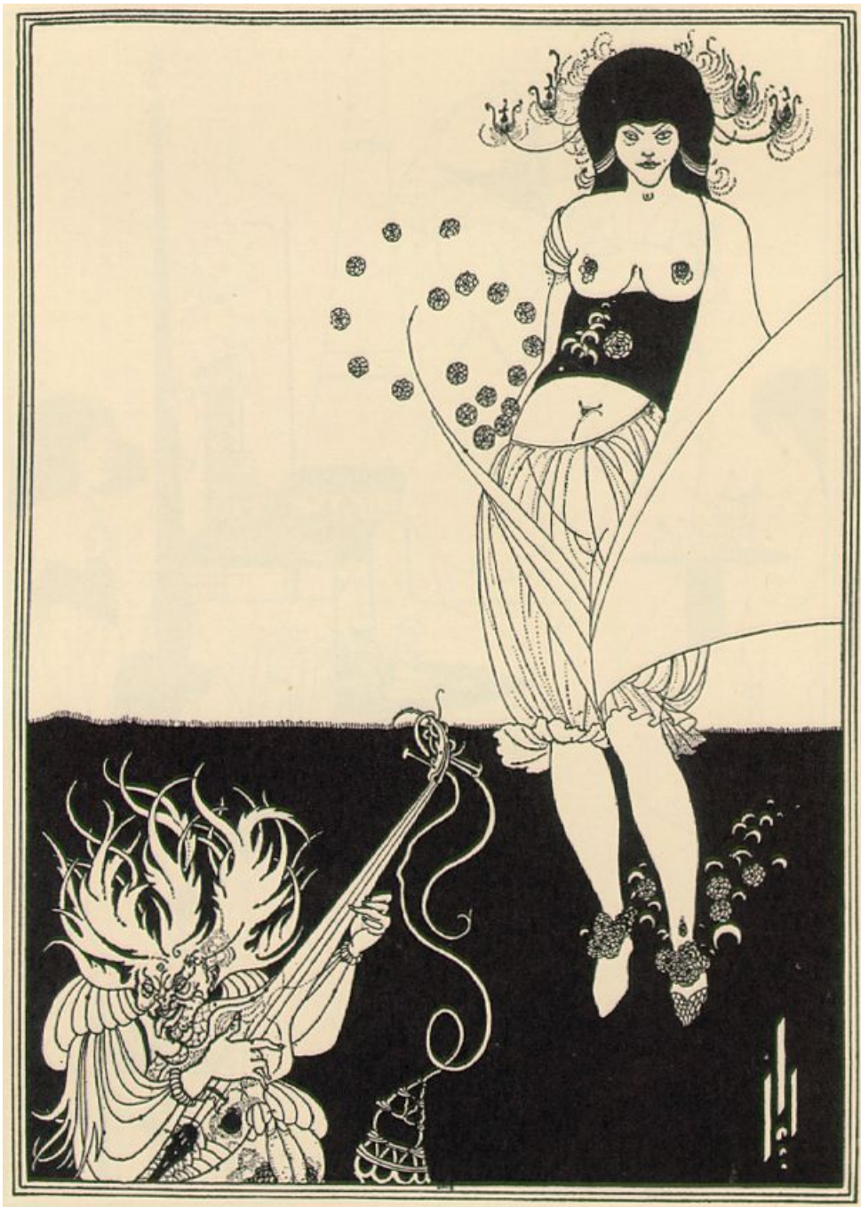
Aubrey Beardsley (1872-1898) The Stomach Dance 1893 From Salome by Oscar Wilde