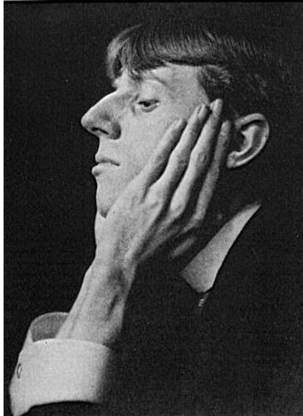
Aubrey Beardsley 1872-1898