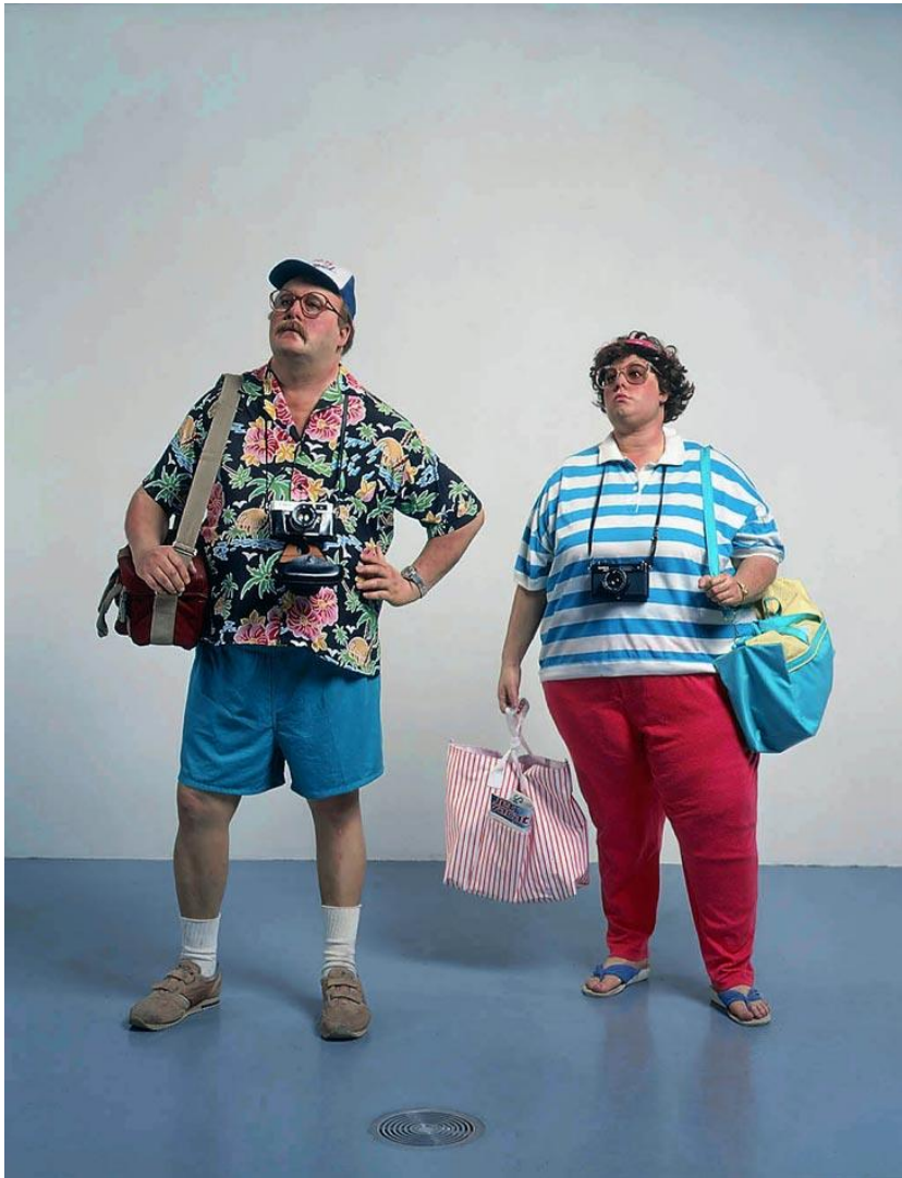
Duane Hanson Tourists II 1988 life size autobody filler, fibreglass and mixed media, with accessories