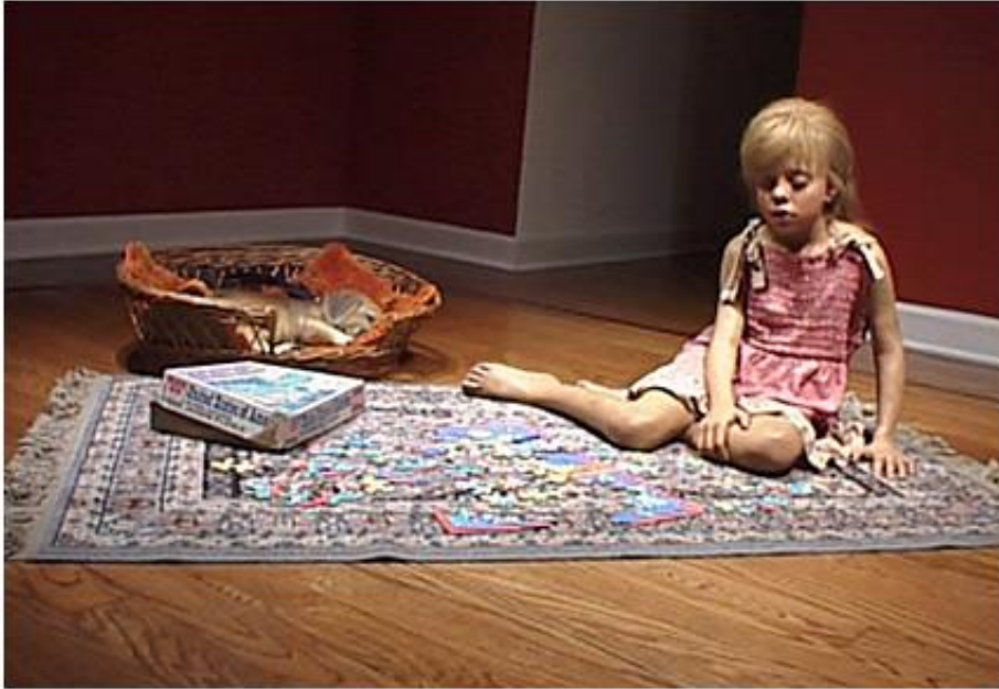
"Child with Puzzle"

Duane Hanson, 1979, polyvinyl with mixed media, life size