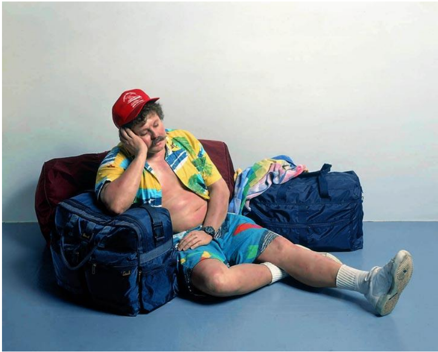
Duane Hanson Traveller 1988 filler, fibreglass and mixed media with accessories life size