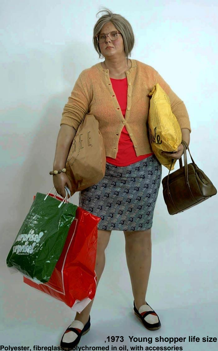
,1973 Young shopper life size Polyester, fibreglass, polychromed in oil, with accessories