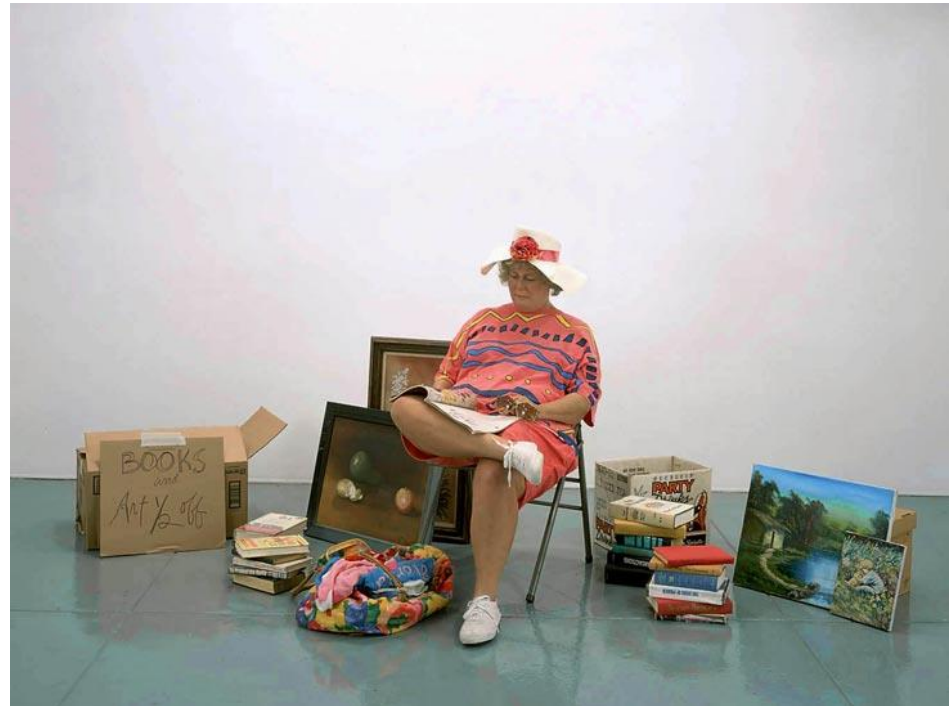
Duane Hanson Flea market vendor 1990 life size polychromed, bronze, with accessories