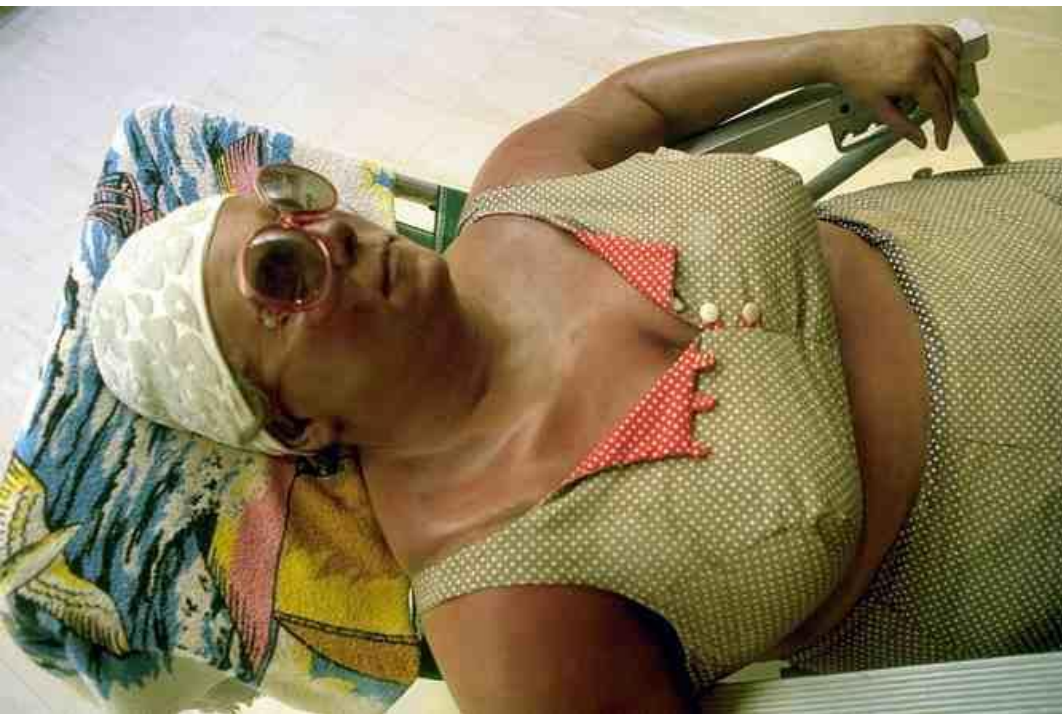
HANSON Duane | Sun Bather. | 1971 | American | Photorealist | |