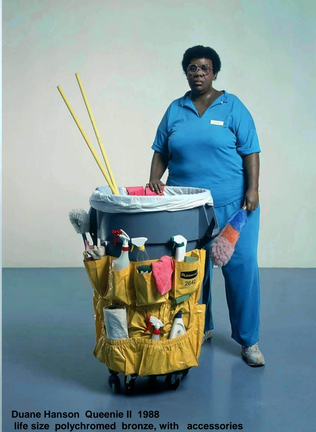
Duane Hanson Queenie II 1988 life size polychromed bronze, with accessories